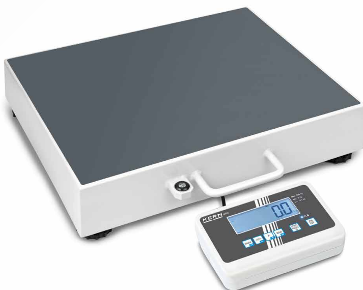
KERN MPC 300K-1LM