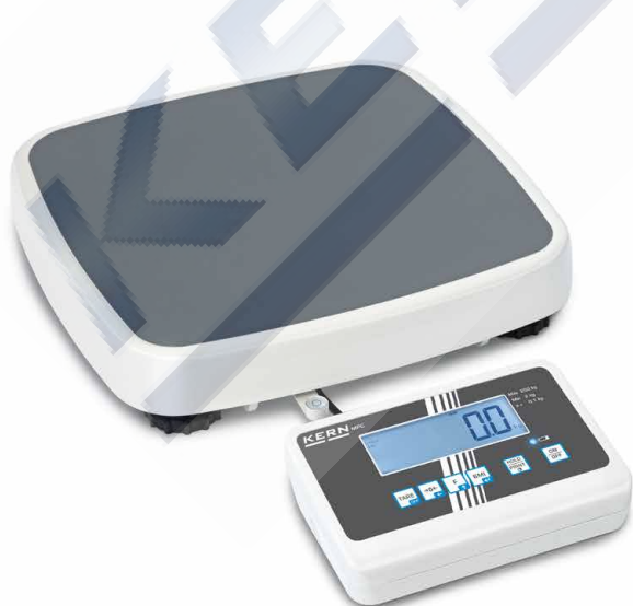
KERN MPC 250K100M

Compact personal floor scale – with approval for professional medical use in medical diagnostics, verification optional